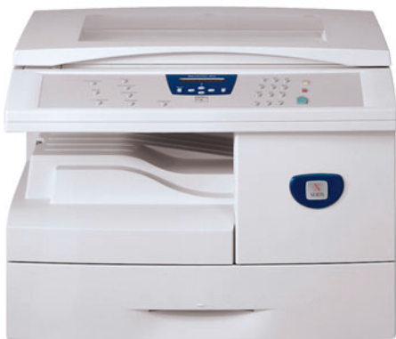
WorkCentre M15 with platen cover

The Xerox name is synonymous with quality, innovation and service. And it means day-in, day-out reliability. The WorkCentre M15 is extremely durable, designed and built to perform flawlessly in today's high-speed, high-pressure workgroup settings.