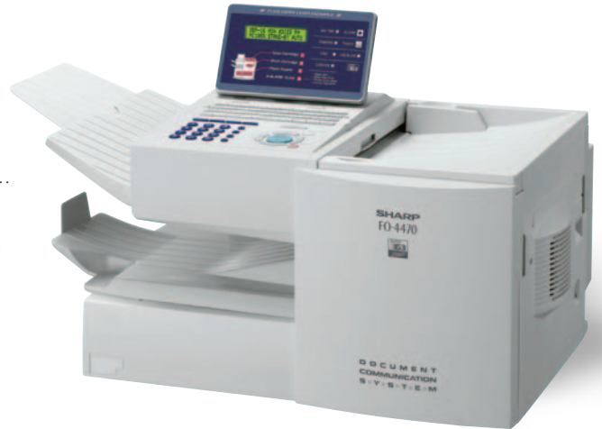
FO-4470 Document Communication System

Designed to streamline your workflow, the new Sharp FO-4470 Super G3 Workgroup Facsimile delivers all the features your busy workgroup demands... and so much more. With a powerful 16-ppm print engine and Super G3 modem technology, the FO-4470 scans at a speedy 1.3-seconds—so there's no wasted time. For added efficiency, the FO-4470 comes standard with advanced features including document memory backup, broadcasting to 154 locations, personal auto-dial phone books, and Remote Diagnostics. With all these powerful features, proven performance, and Sharp's world-famous reliability, the FO-4470 Super G3 Workgroup Facsimile delivers the functionality your business needs today, as well as the versatility to expand as your business evolves.